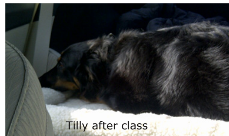
Tilly after class

Dog #3 Are you looking for a great new activity to do with your favorite furry friend? Looking for an alternative class from obedience training? Time for you to sniff out K-9 Nose Work® with Loving Paws, LLC! This is a fun class for any breed that uses your dog's natural instincts to hunt out treats and different scents with positive reinforcement in a fun atmosphere. I attended the Shy and Fearful K9 Nose Work® class. This class is the perfect fit for a dog that needs help adapting to different surroundings. Once your dog is out on the floor working, they are focused on the job at hand rather than the surroundings they would usually find difficult to cope in. From week one to the graduating class, I witnessed all the dogs in the class grow within K9 Nose Work® skills and their confidence. I was amazed of the obstacles the dogs were able to overcome while working on the floor and how they progressed during the class with K9 Nose Work® skills. Even if you don't have a "problem pup", the class is still a great activity. The work your dog does on the floor will leave them happily tired at the end of